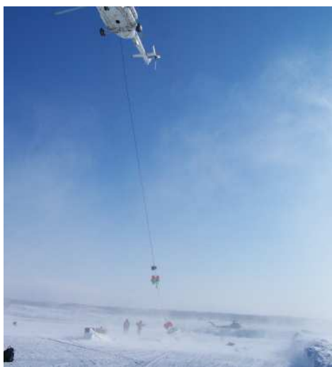
Deployment of Ice Profiling Sonar